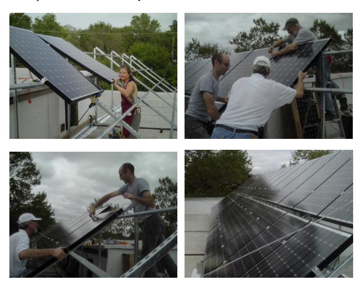
Other volunteers helped with the conduit and wiring of the panels. This was done the following weekend and off-and-on during the week after work.

The following weekend we had a different group of volunteers help carrier the solar panels up on the roof and bolt them to the rack. This too went very smoothly and we had all the panels installed in one day.