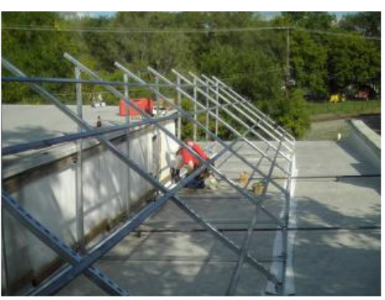
We had several volunteers to help carrier the Uni-Strut up on the roof and bolt it together. The assembly went smoothly and it was up in one day.