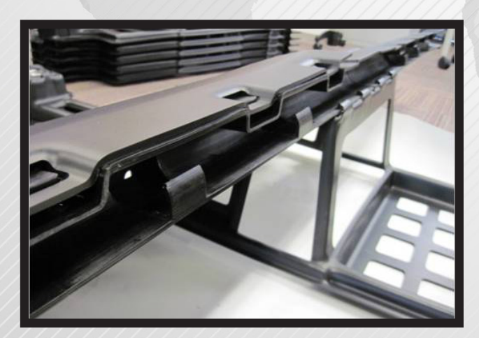
SNAP-TOGETHER TOOL-LESS DESIGN

All specifications subject to change without notice.